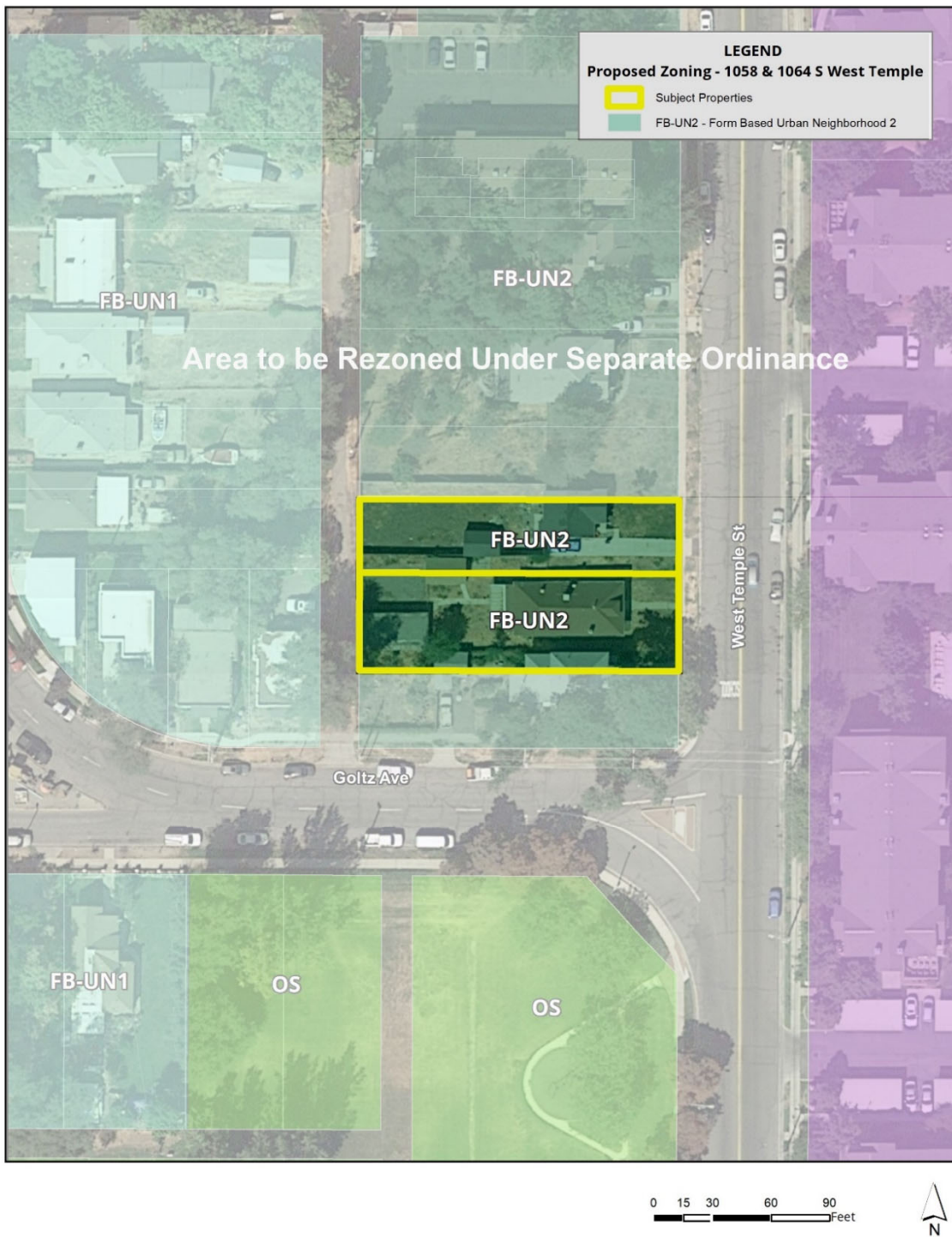
Proposed Zoning Map